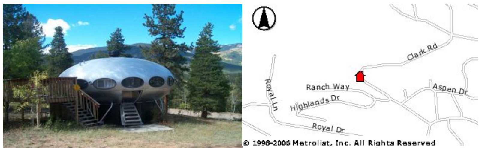
Click here to view property photos