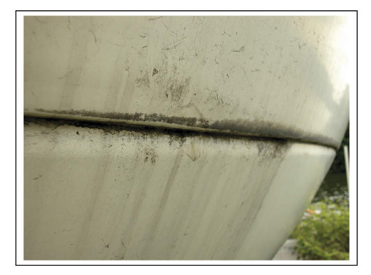
Figure 2. Detail of Futuro showing dramatic evidence of microbial growth.

various plastics. Futuro represents an extraordinary document of its time, of which fewer than 15 examples remain. The Museum Die Neue Sammlung in Munich (http://www.die-neue-sammlung.de/z/enindex.htm) is currently conserving 'number 13', which shows significant damage caused by microbial growth (Figure 2), largely due to exposure – the artwork is still located outdoors. Extensive investigations of the degradation processes were carried out by The Museum Die Neue Sammlung, with The Netherlands Institute for Cultural Heritage (http:// www.icn.nl) performing chemical analysis, and our Department (http://www.distam.unimi.it) conducting biotechnological investigations.