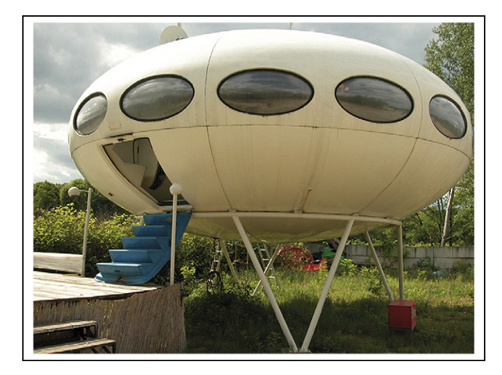
Figure 1. Futuro by the Finnish architect Matti Suuronnen, 1965.

The plastic ski-cabin Futuro was designed by the Finnish architect Matti Suuronnen in 1965 (Figure 1). The exterior consists of glassfibre-reinforced polyester filled with polyester-polyurethane foam and includes windows of poly(methylmethacrylate) (Perspex). The interior also contains